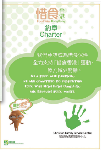
「惜食約章」 Food Wise Charter