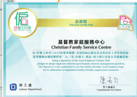
好僱主約章2020 Good Employer Charter 2020