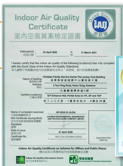
室內空氣質素檢定證書 Indoor Air Quality Certificate

本會餐廳提供工作機會予有熱誠和工作能力的服務使用者。 Our café provides job opportunities to passionate and capable service users.